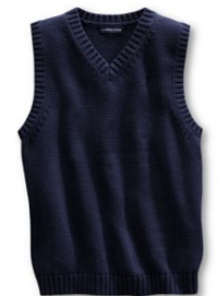
Optional: Navy Sweater Vest