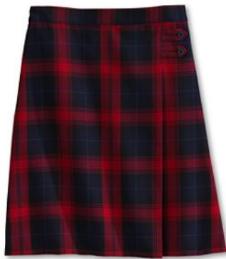
Red Plaid A-Line Skirt