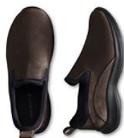
Optional: Lands' End Mahogany All Weather Mocks

Gr. 3 & 4: Brown or Black Leather Belt to Match Shoes Shoes may also be Dark Brown or Black Leather, Dress, or Loafer Shoes Solid White or Navy Socks