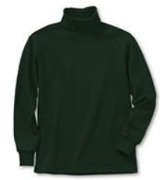
Evergreen Regular or Mock Turtleneck

Evergreen shirts may only be worn with khaki pants or shorts