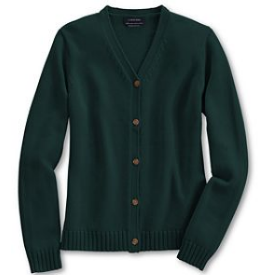
Optional: Hunter Green Cardigan Sweater or Fine Gauge Cardigan Twinset