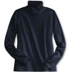
Navy Mock or Regular Turtleneck