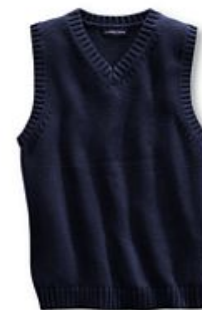
Optional: Navy Sweater Vest