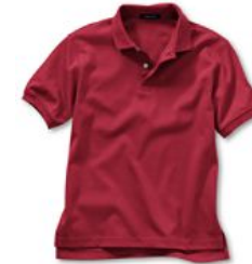
Red Long or short Sleeve Polo