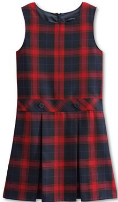
Red Plaid Jumper