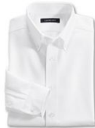
White Long or Short Sleeve Oxford Shirt