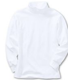
White Regular or Mock Turtleneck