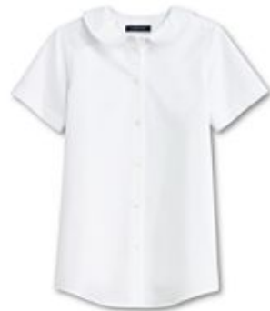
White Long or Short Sleeve Peter Pan Style Blouse (with or without navy trim, knit or woven)

Socks & Tights should be Solid White, Navy, or Red