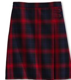
Red Plaid A-Line Skirt