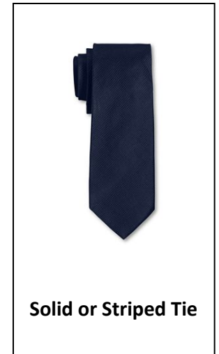
Solid or Striped Tie

Black or Brown Dress Leather Shoes Black or Brown Leather Belt to Match Shoes Dark Colored Socks Tuesday - Friday: Students have a Dress Code