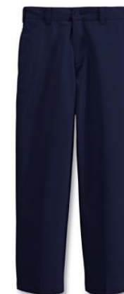
Navy Corduroy or Chino Pants (Navy shorts may be worn April 1 - October 31)