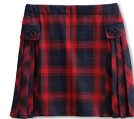
Red Plaid Skirt

Peter Pan style blouse and jumper are also part of the regular uniform. Solid navy or black leggings may be worn under jumpers.