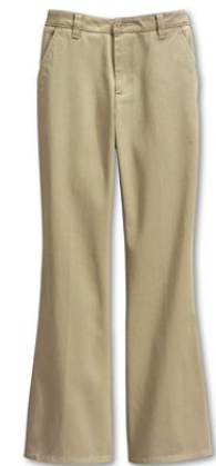
Khaki Chinos (Khaki shorts may be worn April 1 - October 31) Gr. 3 & 4: black or navy leather belt required

Peter Pan style blouse and jumper are also part of the regular uniform. Solid navy or black leggings may be worn under jumpers.