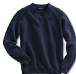
Optional: Navy V-Neck Sweater