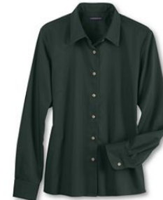
Hunter Green Long or Short Sleeve Collared Blouse