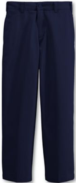
Navy Corduroy or Chino Pants