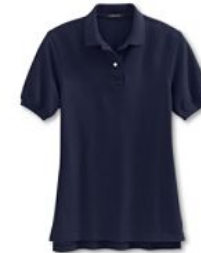
Navy Short or Long Sleeve Polo Shirt