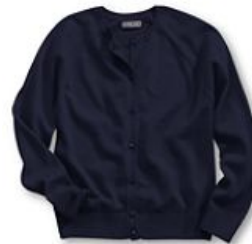
Optional: Navy Cardigan Sweater, Fine Gauge Cardigan with Twinset, or Sweater Vest