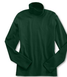
Hunter Green Turtleneck