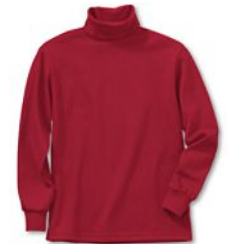
Red Regular or Mock Turtleneck