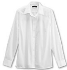
White Long or Short Sleeve Collared Blouse