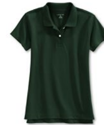
Evergreen Long or Short Sleeve Polo