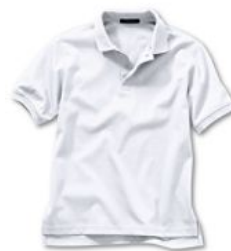
White Long or Short Sleeve Polo Shirt