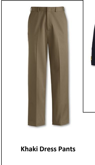
Khaki Dress Pants