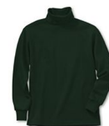
Evergreen Regular or Mock Turtleneck