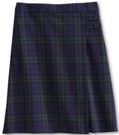
Evergreen/Navy Plaid A-Line Skirt