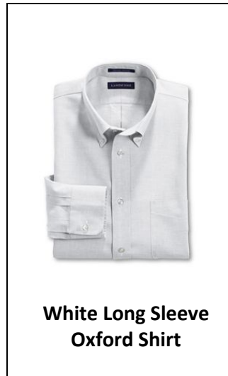
White Long Sleeve Oxford Shirt