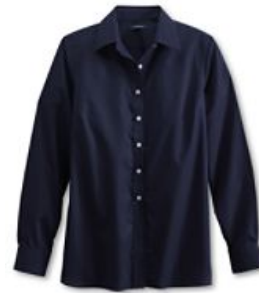
Navy Long or Short Sleeve Collared Blouse