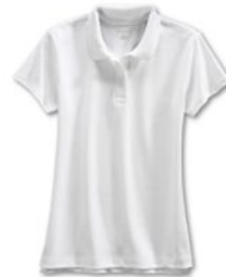
White Long or Short Sleeve Polo Shirt