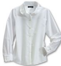
White Long or Short Sleeve Oxford Shirt