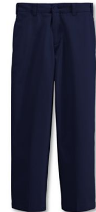
Navy Corduroy or Chino Pants (Navy shorts may be worn April 1 - October 31)