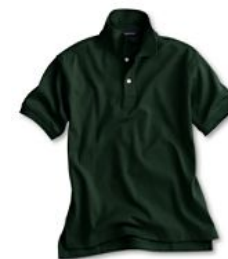
Evergreen Long or Short Sleeve Polo