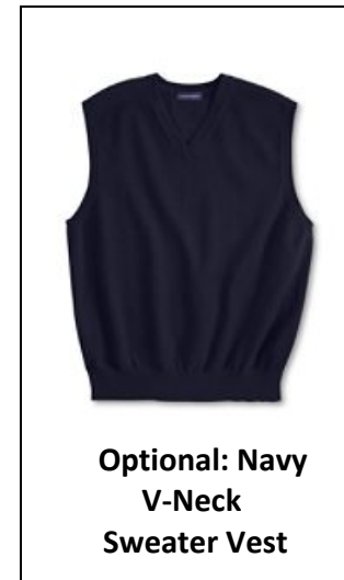
Optional: Navy V-Neck Sweater Vest

Black or Brown Dress Leather Shoes Black or Brown Leather Belt to Match Shoes Dark Colored Socks Tuesday - Friday: Students have a Dress Code